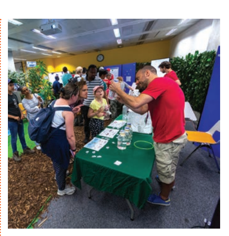
Visitors explore the Greener Futures Zone at the Great Exhibition Road Festival 2019.