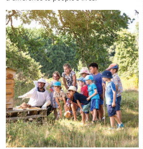
Visitors at Bugs! day at the Silwood Park Campus.

In recent years, we have been reaching out to community groups and organisations from across the local area and have been holding workshops with residents to enhance our understanding of local sustainability concerns and priorities, as well as sharing findings and toolkits with policy makers in local government. The next stage of our engagement is to develop localised networks that bring together researchers and residents to investigate sustainability issues and develop evidence-based actions and policies that can make a difference to people's lives.