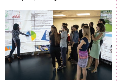
A workshop for the College's policy engagement programme, The Forum.

from across Imperial to bring together expertise from their respective fields to address environmental problems and support evidence-informed policy development. The Ocean Plastic Solutions Network, for example, contributes to the Greener Plastic Future project, which aims to create a technical, socio-economic and policy roadmap for how the UK can prevent waste plastics from entering the environment. A focus on evidence-based policy making is also at the