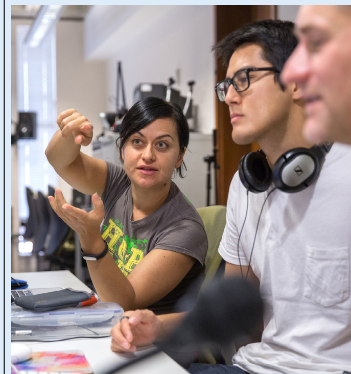
Science Media Production MSc