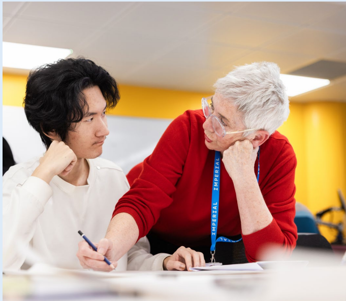
Horizons/I-Explore Practical Art