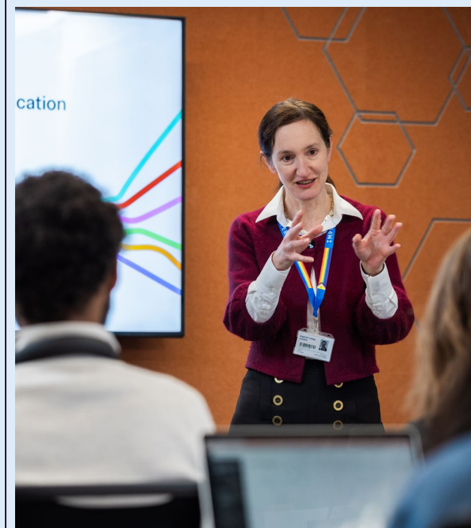
I-Explore/Horizons German Level 2