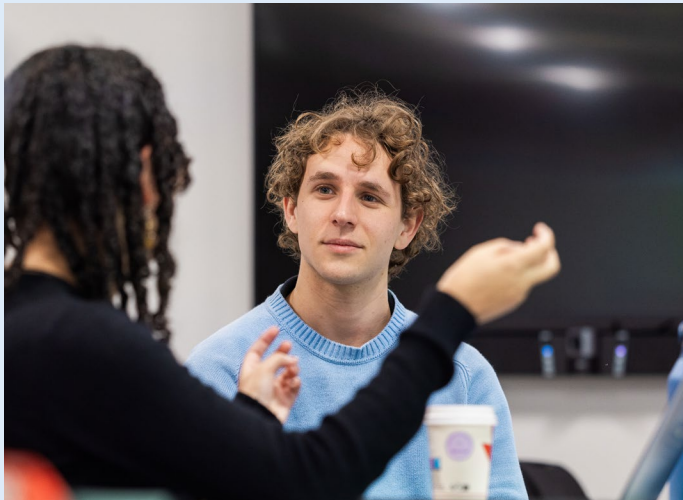
Horizons/I-Explore French Level 6

“Every topic is covered with such depth and genuine interest. I also really enjoy the way the lectures are structured with an emphasis on discussion and debate in the second half.”