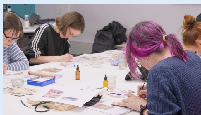
Imperial after:hours Manuscript Illumination

“I’ve loved gaining experience with designing a project from scratch with sustainability in mind, thinking about the challenges and being creative with solutions, as well as working within a team and meeting people from different courses.”