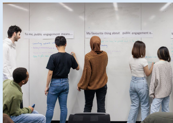
I-Explore Public Engagement: Connecting Audiences with Research