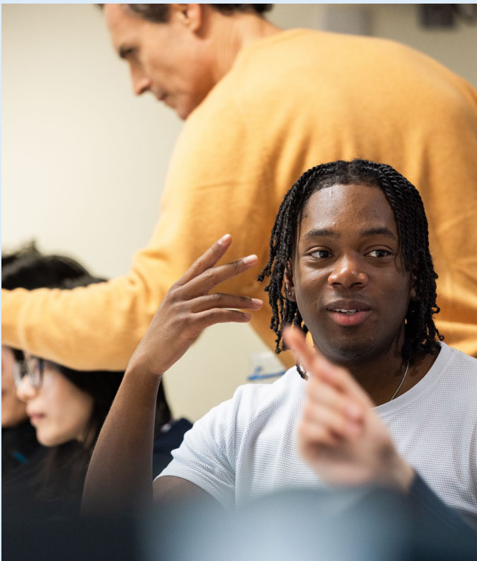
Horizons/I-Explore Music Technology

Postgraduate student Business Ethics for Chemical Engineers