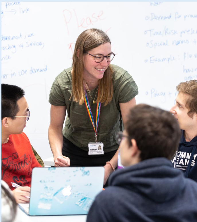
Horizons/I-Explore Lessons from History

“Japanese Horizons courses never cease to amaze me. Always amazing and engaging teachers, great content, interesting topics. I can really learn a language like this.”