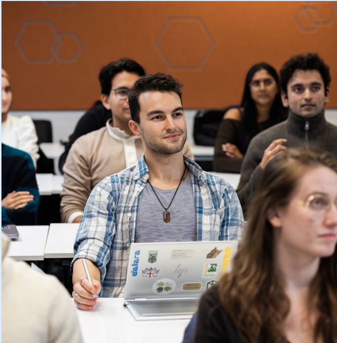
CLCC Student Workshop