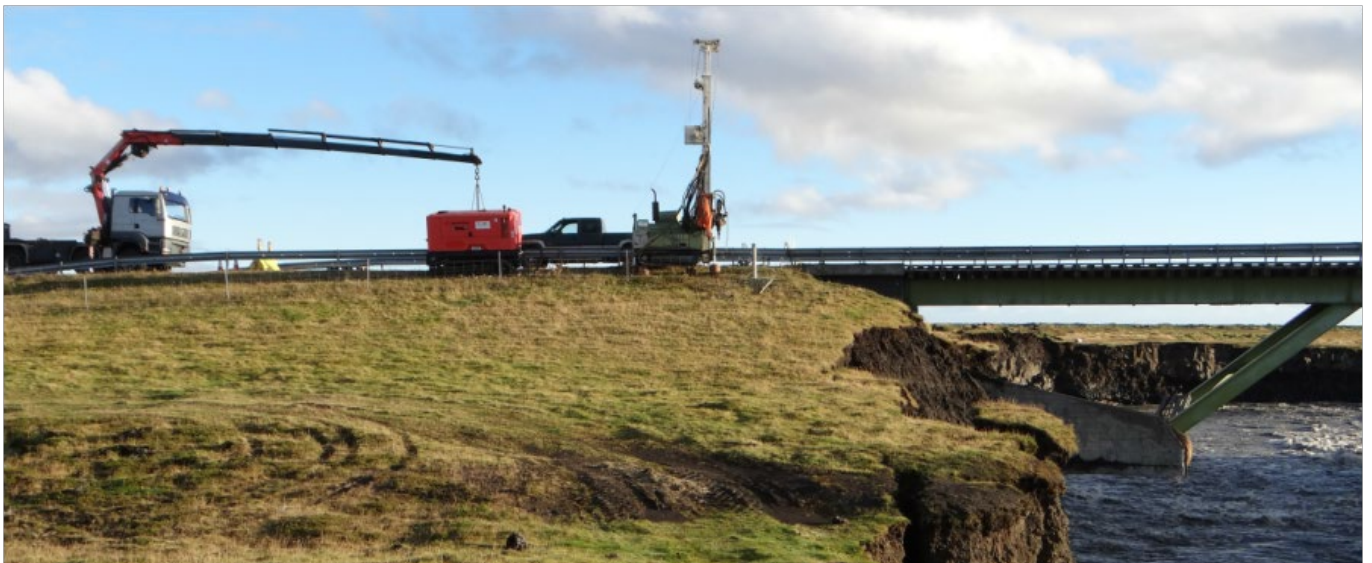
Figure 2. Figures, tables and graphs are allowed to fill either one or two columns,