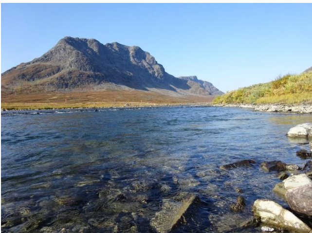
Day 8 – 10<sup>th</sup> September

When we woke up, the clouds were clinging to the summits all around us. We made our way to STF Kaitumjaure, which was decorated with moose antlers. We carried on through the trees which were turning an amazing yellow colour, which looked brilliant against the blue of lake Kaitumjaure.