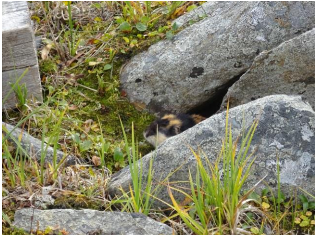
Day 5 - 7<sup>th</sup> September

We knew that today was going to a long day hiking, so we set off early, again without a cloud in the sky. We continued down the valley towards STF Singi. After a while, we came to a fork in the path that we hadn't noticed on the map, with a sign pointing to Kebnekaise and a potential shortcut. We decided not to take it, and instead carry on to the Singi hut where we would be able to check the weather forecast for the next few days. If the weather forecast looked good, we would head towards Kebnekaise, but if it was looking bad we would instead continue along the Kungsleden.