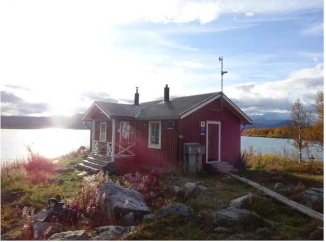
Day 11 - 13th September

We made our way down from our camping spot to the Sami family's house, where the lady took us across the lake. We slalomed around floats and rocks – it took around 20 minutes in the motorboat and in hindsight it would have been extremely difficult to row.