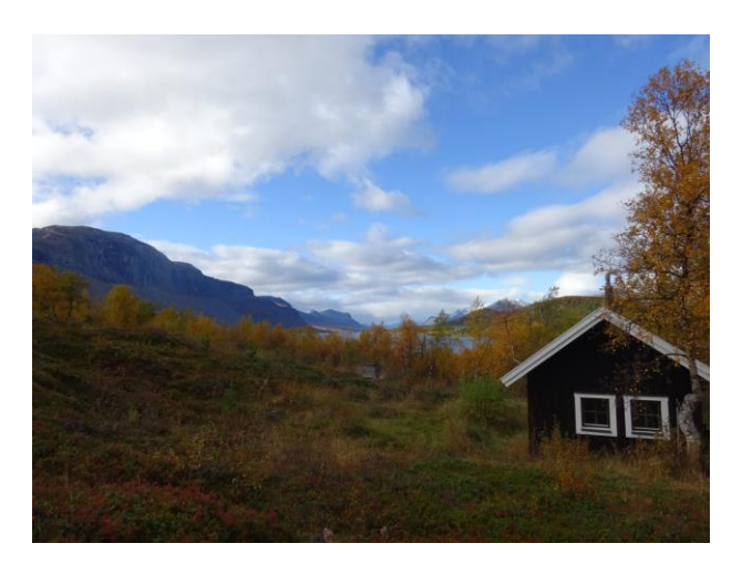
Day 18 - 20th September

We arrived in Kiruna around 6pm, though it felt much later as it was so dark due to the rain and thick cloud. We made our way back up to Camp Ripan and quickly put up the tent, before heading back into town to find a pizza shop which was exactly what we both craved! We stopped off to pick up pudding from Co-op, then crashed in our tent.