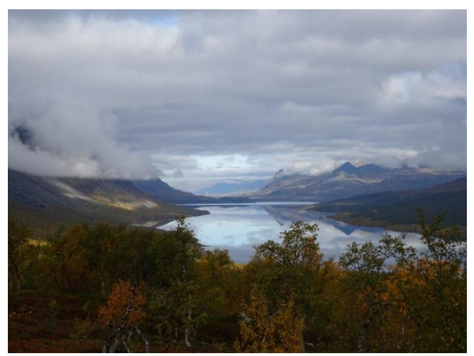
Day 10 - 12<sup>th</sup> September

We woke up early and packed up all of our kit that we had left to dry the day before. We also picked up a gas canister that had been left in the communal area as a backup for our other stove.