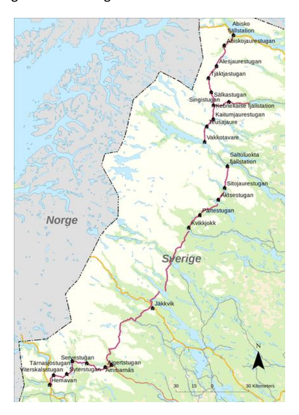
Figure 1 - Entire Kungsleden route<sup>1</sup>

From Vakkotavare, the trail heads south, but skirts around the edge of Sarek national park, only dipping in for a short section in the south-east corner. This middle section of the trail is by far the least visited, as there are no STF huts along it's 179km length.