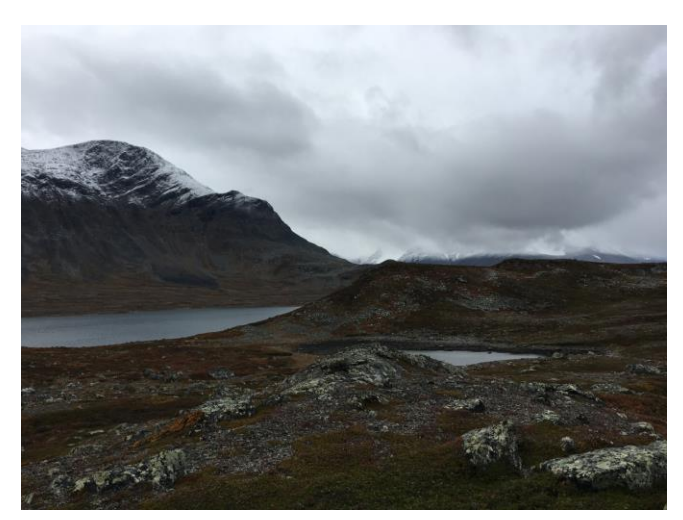
Day 15 - 17<sup>th</sup> September

It was another restless night, thinking about whether we would be able to cross the river or not. To give us the best chance of crossing safely, and not making rushed decisions, we woke up really early. Overnight, everything that we'd left in the tent awning – boots, bottles, clothes – had frozen completely solid. It was very cold, but we had the most amazing views down into Sarek, with clear skies and snowy