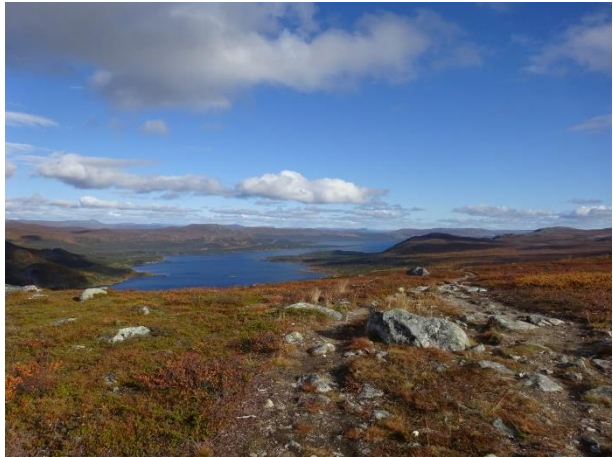
Day 17 – 19<sup>th</sup> September

We woke up to a very damp and depressing day, so decided to travel to Gallivare, rather than staying around the mountain station for an extra day. We cooked breakfast and packed up our gear in the service house (Jemma also got a foot massage from a friendly German lady). Just before catching the boat across the lake, we saw the two German men from several days before in Sarek, as they arrived at Saltoluokta. Before we left, we weighed our bags on the scales outside of the hut – Ollie's weighed 17kg and Jemma's 13kg. This was with no food left, so we were roughly 18-23kg at a maximum at the beginning.