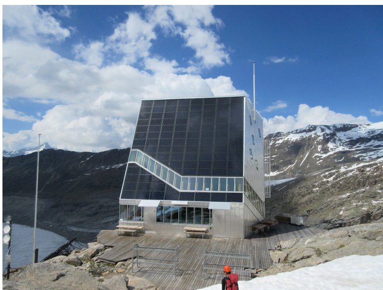
Figure 8: The space age Monte Rosa Hut

the hut while waiting for this snow to consolidate. We set the alarm for 2:00 to continue the traverse via Lyskamm as forecasts are not always reliable, we awoke to heavy snowfall and continued to wake at 2hr intervals until 6:00 when the snow stopped. At this point there was too much snow and it was too late in the day to attempt to continue the traverse but only a few centimetres of snow had fallen so we could leave the hut.