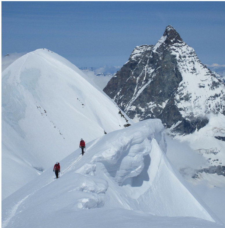
Figure 5: The view of the Breithorn Summit Ridge with the Matterhorn in the background

For our first climb of the trip we decided to take an opportunity to acclimatise by climbing the Breithorn (4164m) via the Central Summit to the West Summit. This was a straight-forward climb attempted from the Klein Matterhorn lift station. Conditions were excellent with the sole regret being that we hadn't taken a hint from the legion of ski-mountaineers and had to walk down from the summit! A highlight was the final section along the ridge from the central to west summit which became narrow and slightly icy. The climb was completed in 2.5hrs, far below the guidebook time of 4hrs. We then rested at the upper lift station (3883m) for 4hrs in order to get the maximum possible acclimatisation from our trip.