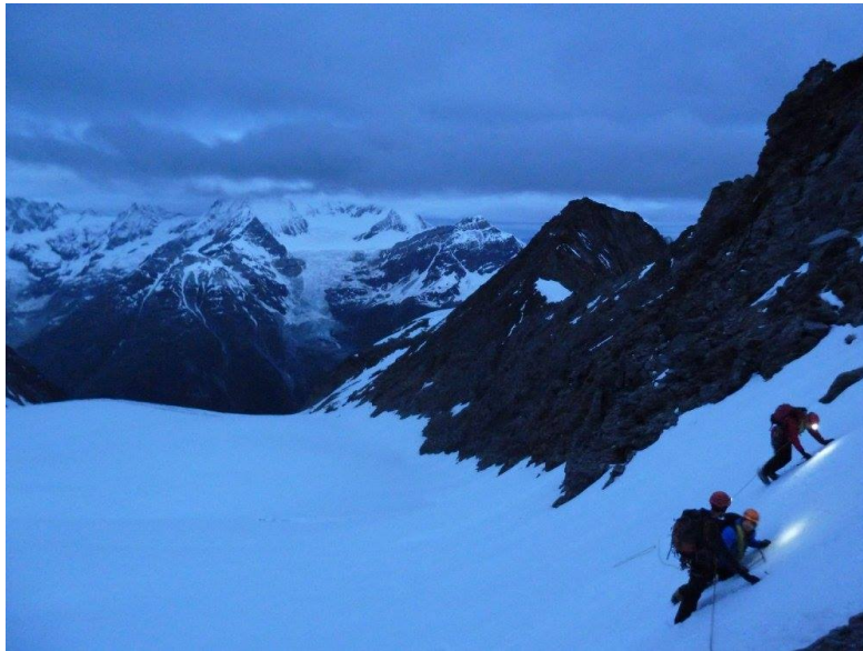
Figure 12: The team traversing below the ridge on the Normal Route up the Dom

the lift station and went back to the campsite.