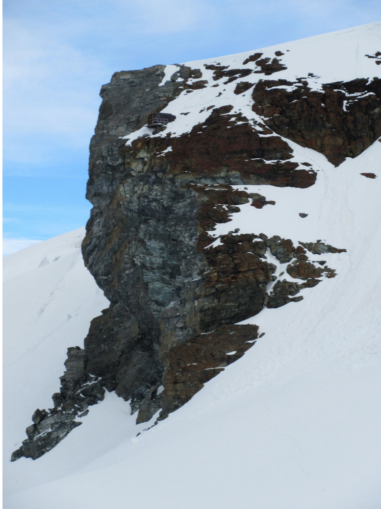
Figure 15: The Rossi e Volante Bivouac