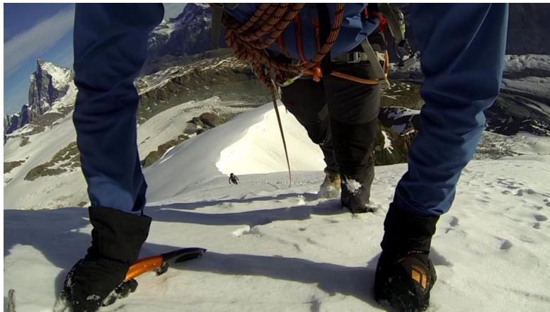
Figure 13: A leaders-eye view of the approach to Triftjplateau from Triftjcol

This was undertaken by Ben & Tom. After ascending to the Gandegg Hut the previous day and inspecting the approach as well as the beginning of the route itself, we woke up at 03:00 to descend to the glacier and then crossed it, before climbing the first steep snow slope to Triftjcol. We did this in 1.5 hours, 30 minutes under the 2 hour guidebook time. There was considerable debris on this initial snow from previous avalanches, but this was not a challenging obstacle. We continued up the snow slope, crossing the shoulder onto Triftjplateau in an additional 1.5 hours - putting us an hour under the 4-hour guidebook time to Triftjplateau. This second section contained steeper, more exposed climbing on some of the best snow we experienced throughout the trip, however this was still not as good as we have experienced on pretty much every other alpine trip undertaken.