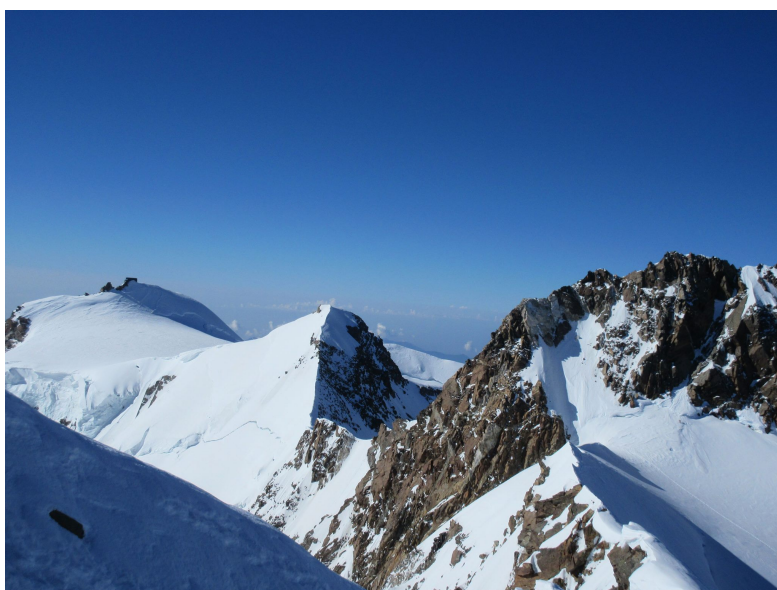
Figure 9: A photo from the top of Nordend showing Doufourspitz, Zumsteinspitze and the Margherita hut

to Martigny in Switzerland was at 11:35. So after pizza and fulfilling our desire for limoncello we found a quiet corner of the park and went to sleep (we were too filthy to stay in a hostel). Unfortunately we had not much sleep due to sprinklers turning on at 3:00 and ended up finding breakfast in a Carrefour in a daze at 6:00. We then passed the remaining time by looking at some ruins and drinking endless cappuccino in a local cafe. The journey back was uneventful apart from crossing the Swiss border without passports or any form of ID, the border guards after some discussion believed our story and let us through. If we had not been allowed to cross the border we would have had to cross at a mountain pass on foot, although at this point hygiene was becoming quite desperate 4 days in and with a heatwave. From Martigny we took the train to Visp and then Täsch arriving back at the campsite in the late afternoon.