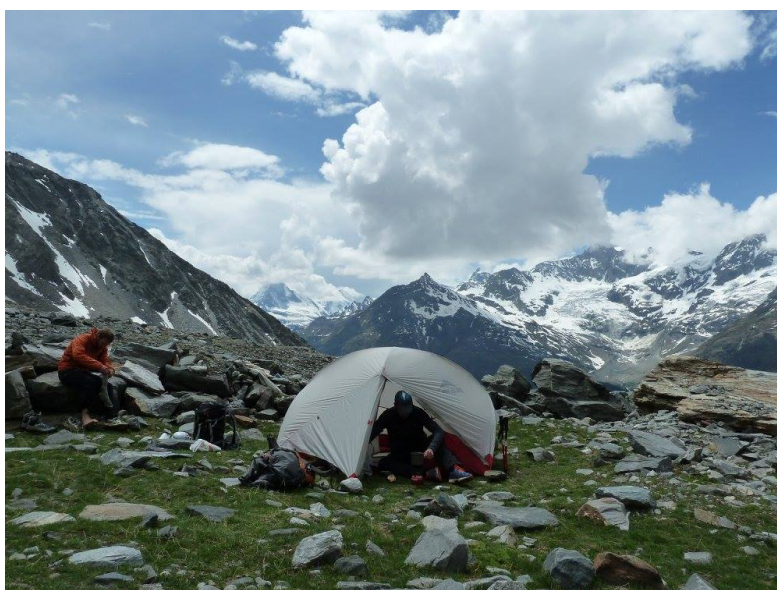
Figure 10: The MSR Hubba Bubba in use the night afternoon before the attempt of the Täschhorn