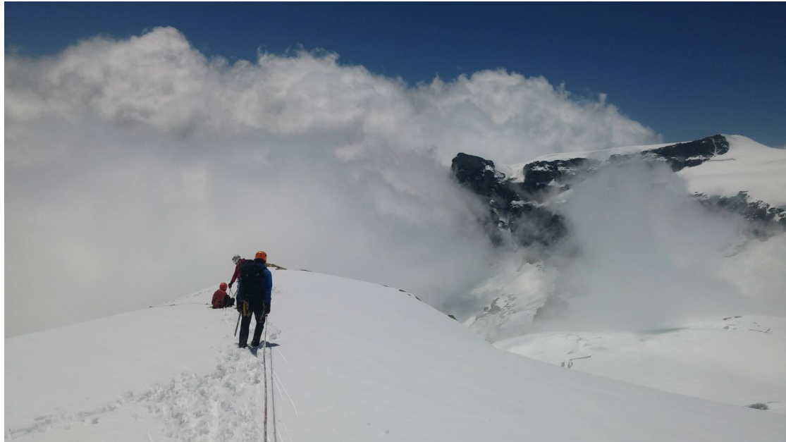
Figure 14: Some of the team in front of a view of the Italian Alps

This expedition was envisaged as an important opportunity to train and develop as climbers, we view the trip as having been a significant and successful stepping stone on the road towards more ambitious mountaineering objectives.