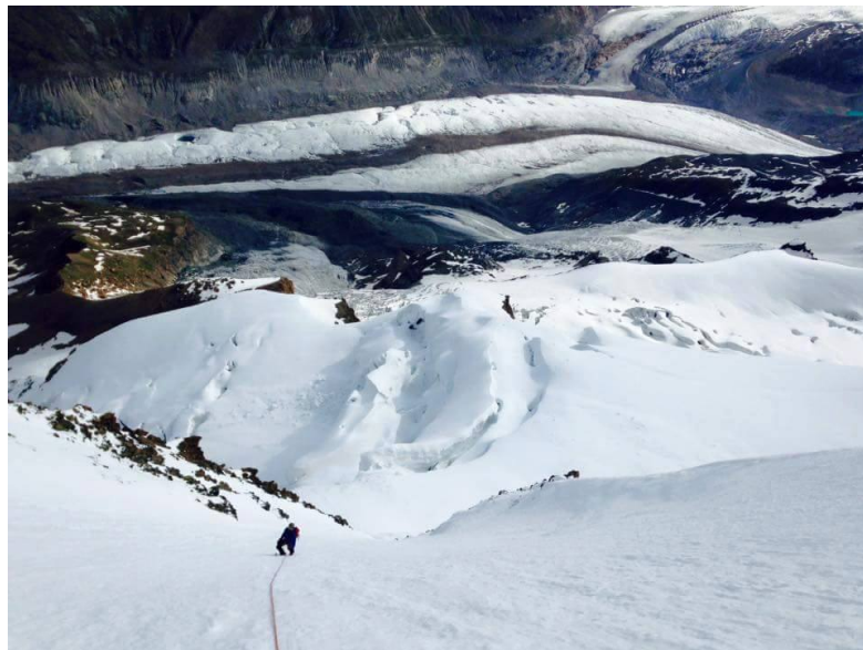
Figure 3: The view of Trifyplateau from the upper pitches of Triftjgrat

Locally, we were able to travel between Zermatt and Täsch by using the regular Zermatt-Täsch shuttle train, which was CHF8.20 return. Regular trips to Zermatt were required to access some routes and mountain regions, but also for more mundane tasks such as purchasing gas cylinders and food.