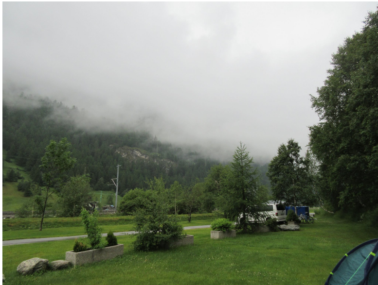
Figure 4: A classic Alpine view during one of our many wet weather days

While we were expecting typical June snow conditions and weather patterns, we could not have anticipated the Europe-wide heat wave that spanned the trip. A 3,800m freezing level, combined with snowfall typical for the time of year, created difficult conditions for climbing. This seriously hindered activity throughout the trip, because the repeatedly poor consolidation led to high avalanche risk. Whilst this greatly improved our assessment of avalanche conditions, it also prohibited our ability to climb the number, remoteness and difficulty of routes that were initially envisaged.