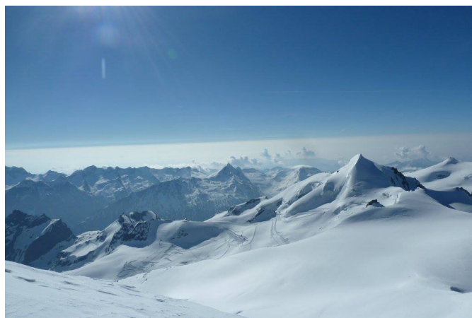
Figure 6: A photograph taken during the ascent of Alphubel

The next morning we started walking at 5:00h with our head torches on. For the first 500m or so of ascent we are following the ridge of a moraine. Then it was time to put the crampons on and rope up. We walked up the southern arm of the Alphubel glacier, but breaking trail was very hard work due to the deep soft wet snow. The French ski tourers soon overtook us on the northern side of the glacier. We reached the Alphubeljoch (3771m) at around 8:30h. Unfortunately, very dark clouds were moving in and the wind picked up, so we made the frustrating decision to turn around here and go back down. The summit was still a good 500m of ascent away, and progress was very slow due to the snow conditions, although we were still ahead of maximum guidebook time at this point. Back at the Täsch hut we had a massive lunch before descending back down to Täsch. Alphubel was in the clouds for the rest of the day. Very frustrating but turning around was definitely the right call.