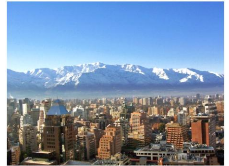
Image of Santiago, Chile

At the end of the trip, I was rewarded by getting positive results in my project: after a month of experiments I was able to detect mRNA of the beta2 subunit in sciatic nerve. But I was also feeling changed and enriched thanks to the people I met, to the sites I explored and to Neruda's poems. Surprisingly I did not regret having exchanged a month of my summer for the austral winter!