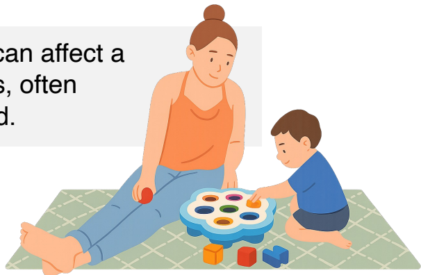
For Every 100 Babies with Mild HIE at Age 2