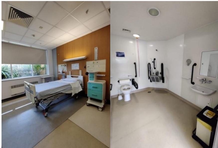
Photos of a room with en-suite bathroom at the quarantine unit.