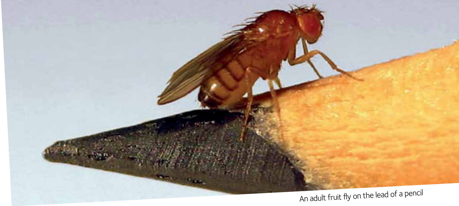
An adult fruit fly on the lead of a pencil

Researchers currently have a choice of several animal models to work with, including mice, rats, flies, worms and zebrafish. However, we don't yet have a model that completely reproduces what happens in the nerve cells of people with Parkinson's. So we need to develop a variety of complementary models. This is achieved by doing things like changing an animal's genetic makeup, or treating them with certain chemical agents that may start a slow, progressive nerve cell death.