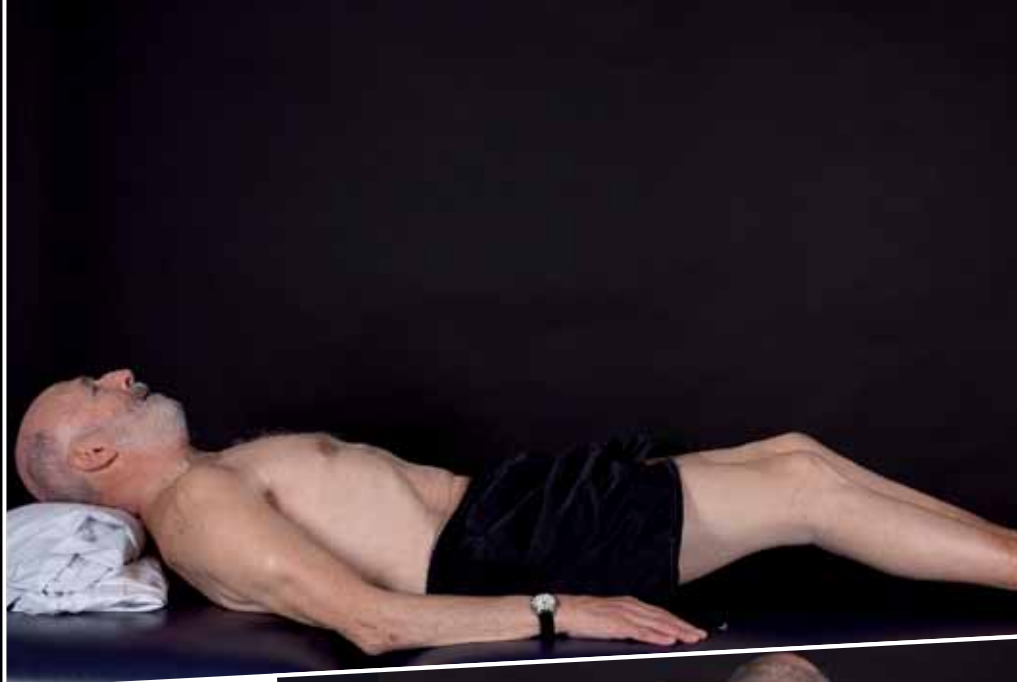
Images of an individual with Parkinson's who has camptocormia

"At present, we don't know how common these postural problems are in Parkinson's, or who is at most risk of developing them. We also need to investigate the impact they can have on peoples' mobility and quality of life, in order to provide more appropriate treatments. This study will be a building block to providing better management of these problems."