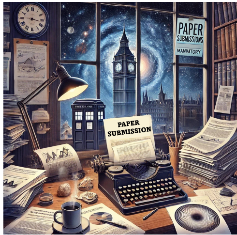
Figure 1. Sample figure - IEPC 2025 paper submission graphic