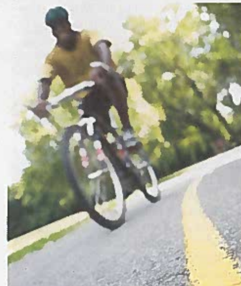
As summer approaches occupational health are offering staff the chance to get on their bikes

Roadshows to promote the scheme will be held on 9 May in the Sheffield Building foyer, South Kensington Campus, from 11.00-15.00, in the Commonwealth Building, Hammersmith Campus, 10.00-12.30, and on 12 May in Reynolds Building, Charing Cross Campus, 14.00-16.00.