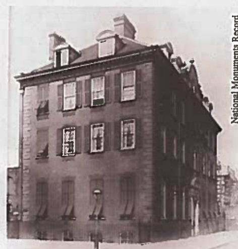
National Monuments Record

It was agreed that the house should be adapted for use by the Governing Body with provision for the Rector's lodgings and other staff accommodation. The consulting architect to College, Sir Hubert Worthington, began alterations that were continued by T.W. Sutcliffe and completed in 1962. Dame Sylvia Crowe designed the landscaping of the garden, and other alterations included moving