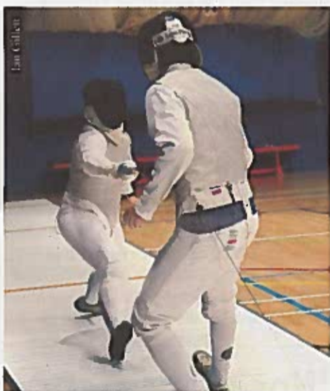
Members of Imperial's fencing club gave demonstrations on the day

"It was a very close race that London won," he said. "I think it wouldn't have been nearly as close if the IOC inspection team