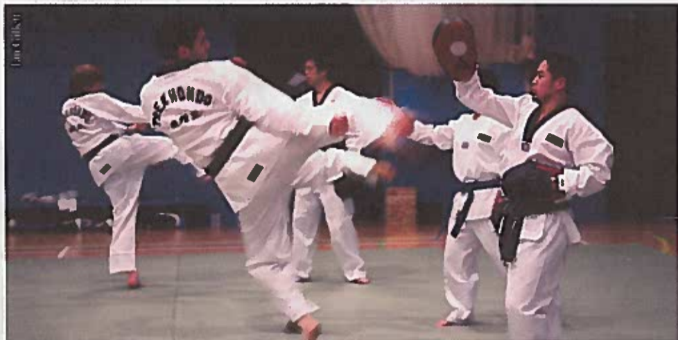
Members of Imperial's Tae Kwon Do club show off their skills