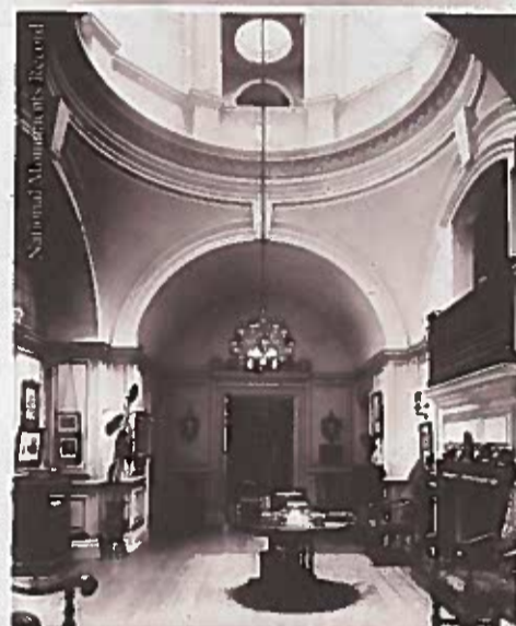
170 Queen's Gate photographed whilst owned by the White family. The pictures were taken by Bryan Shaw, son of the architect Norman

the original southern boundary wall and some changes to minor architectural features.