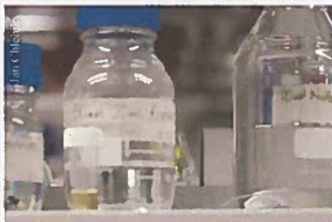
Research teams invited to apply for research excellence awards now

There will then be a two-stage selection process. The applications will first be considered by an internal College panel, which will decide a shortlist of six. The shortlist will be announced by Friday 21 July. During the second stage, an external panel, headed by the Rector, will determine the three winners. These will be announced by Friday 29 September.